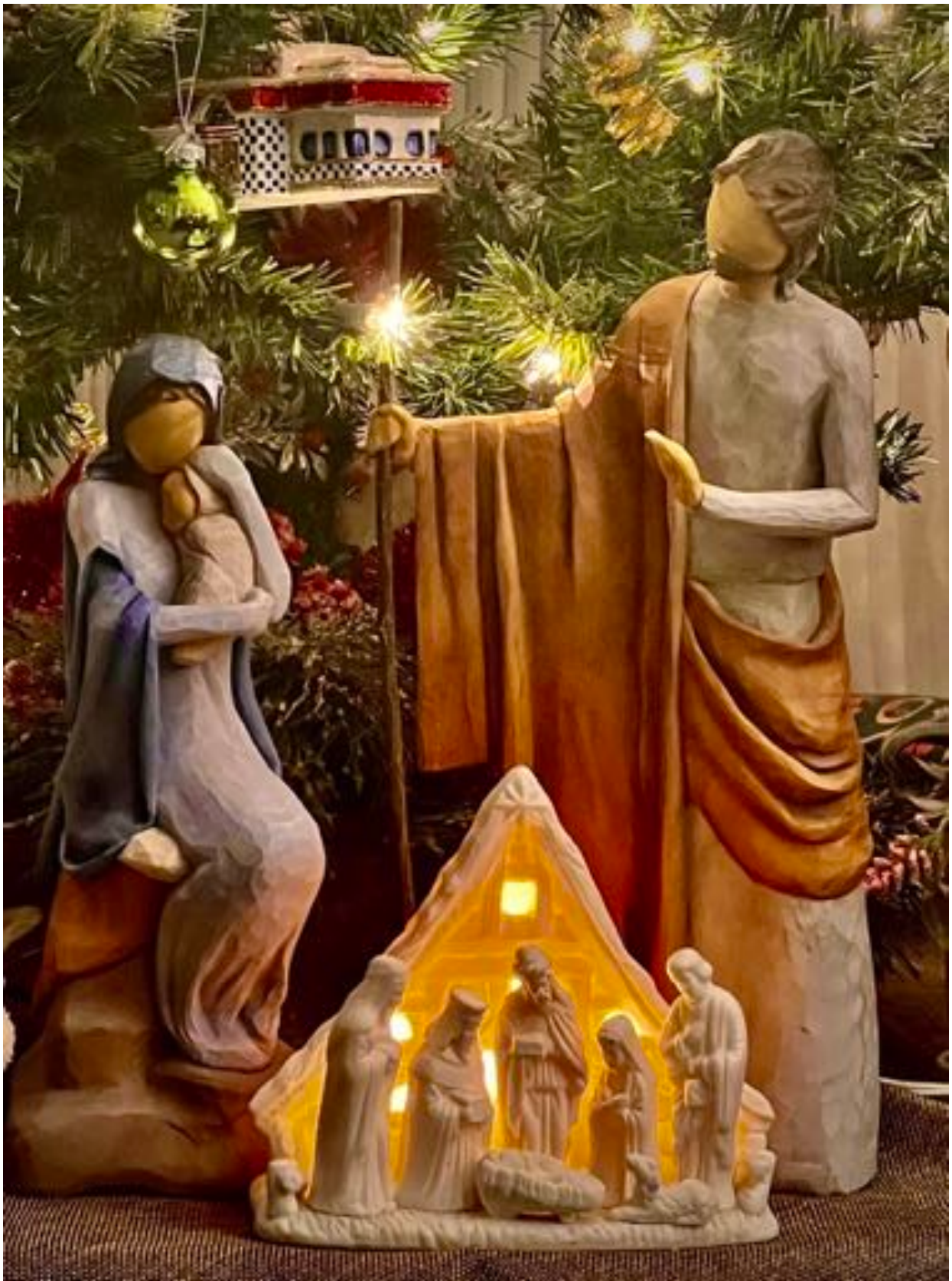
St. Michael's Christmas Bee, January 7, 2024