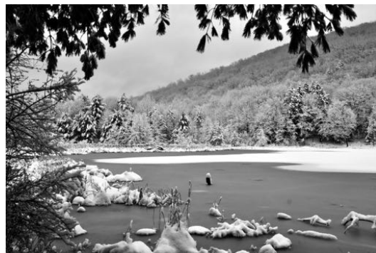
Winter Delight in the Southern Tier

Sunday: 1 Corinthians 6: 12-20 St. Luke 15: 11-32