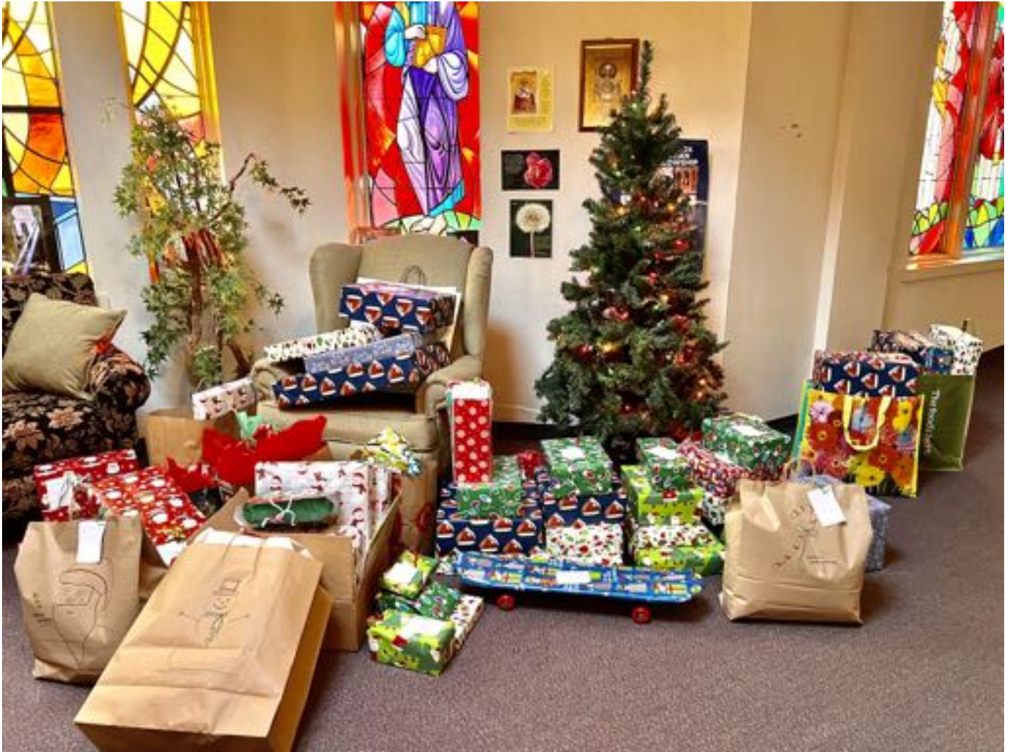
These are some of the gifts that were brought to the Church for distribution to three families who are having a wonderful Christmas today thanks to the generosity of so many faithful and friends from St. Michael's. Thank