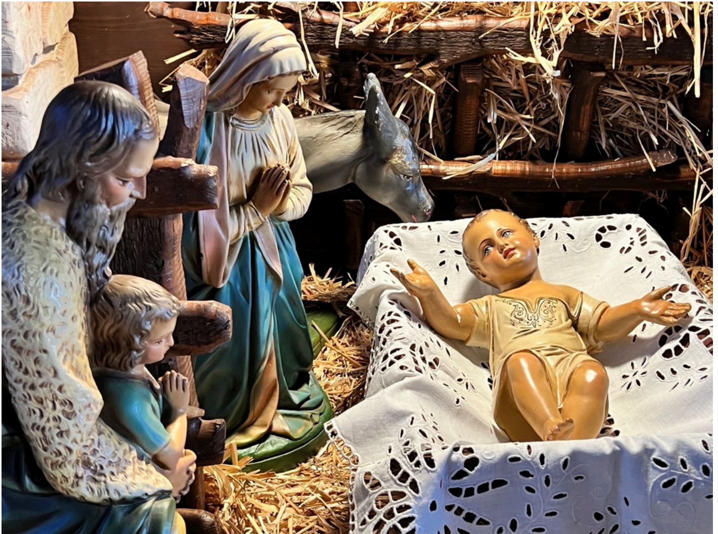
A Christmas Memory as we approach the coming Feast of the Baptism of Our Lord on Thursday evening and Friday