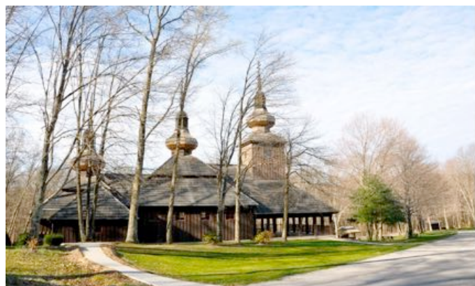
SS. Cyril and Methodius Orthodox Church, Mercer, PA